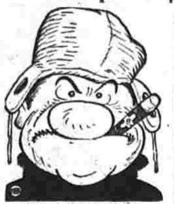
The Old Boy Himself!

By MAJOR AMOS R. HOOPIE Grandfather of American Football Hoopie, my million of grand readers! Let the whole world know that I am back off for another grand season of the game which I facetiously call "Baseball Hoopie." I have been the granddaddy of the game since the first football Saturday afternoon from a rural vacation home in the pine woods. Though apparently removed from the busy scene of grid preparation, I am as well posted on the activities as possible through the intelligence conveyed to me by special messenger from my place in the bookery. I have been through a brief walk. This I can give you six upsets for the current season. Boston College defeated California, 14-7. North Carolina State over Washington State, 14-7. Duke, Missouri over Vanderbilt, 14-7. Oregon State and Southern California, 14-7. Oregon State and Southern California, 14-7. Oregon State and Southern California, 14-7.